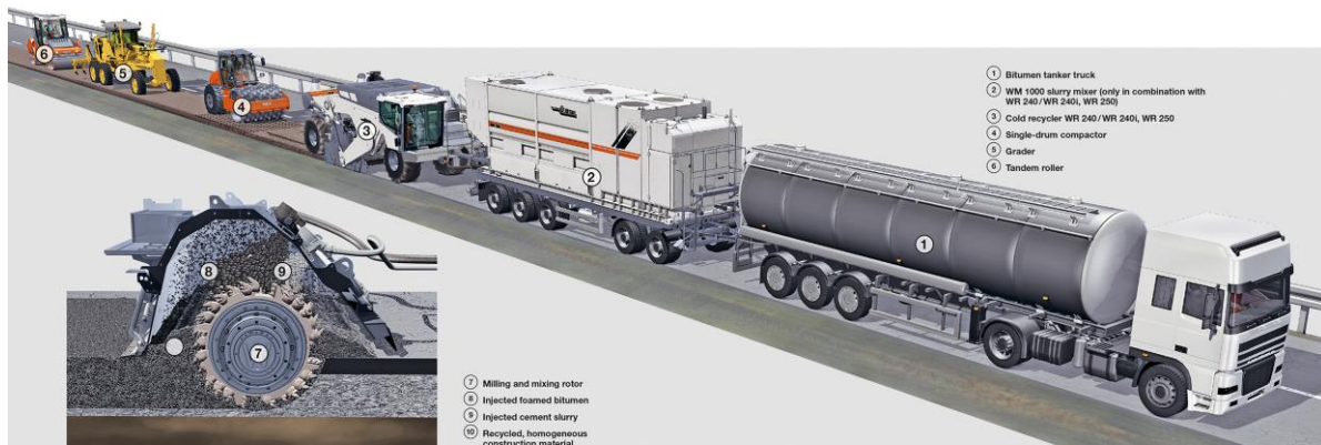
Figure 1: Cold in-situ recycling – foamed bitumen, cement suspension (typical known set of machinery) [3]

In relation to the aforementioned technological options, the construction machinery performs activities further specified in Table 1.