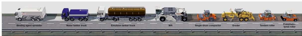
Figure 3: Cold recycling – set of used machinery (example), [3]