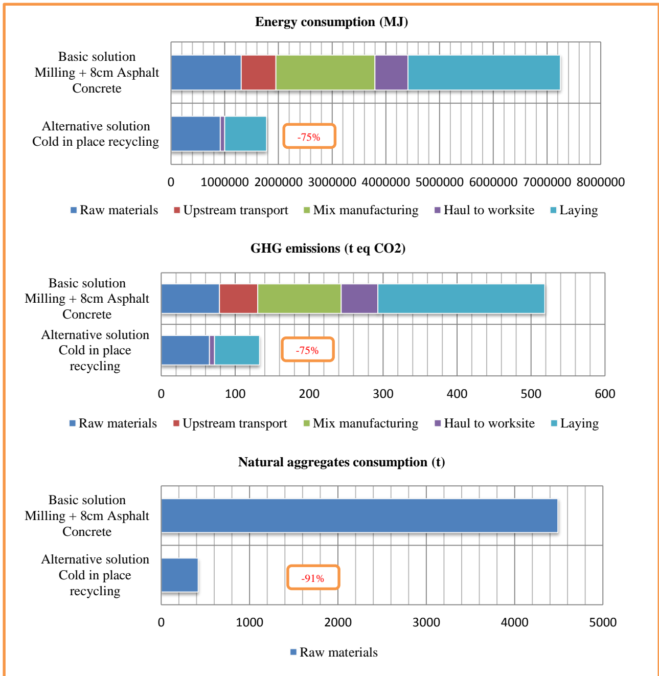
Figure 2: Comparison between basic (Miling+AC) and alternative (Cold in place recycling)

The charts in Figure 2 were taken from the SEVE final report and can be used to compare these two solutions. As can be clearly seen, for these 3 indicators, the cold in-place recycling technique offers a substantial improvement compared to the basic solution.