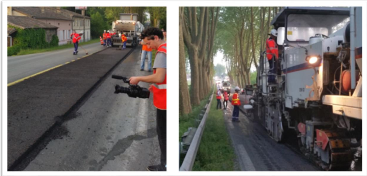
Figure 1: Cold in-place recycling with bitumen emulsion

Since this road had been reinforced during the 1970-1980 period, the Department was confident it had sufficient thickness of bituminous materials to implement this technique after taking preliminary bore samples. Technologies with low GHG emissions, low energy consumption and, above all, low consumption of natural aggregates such as cold in-place recycling with bituminous emulsion, have deliberately been given priority for this site, in light of the 2009 commitment of the Gironde Department to the Agenda 21 program and the strong emphasis it places on these criteria in its tenders. In addition, mindful of the morning and evening peak traffic, the selected technical solution allowed performing the cold in-place recycling work at night and with a minimum raise in the road profile.