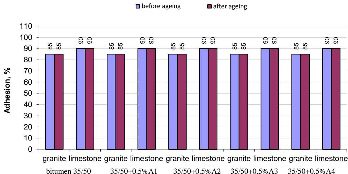
Fig.4. Adhesion of bitumen 30/50 to granite and limestone with the addition of adhesive agents determined by BOP IIB method

The studies showed that different methods of sample preparation (“BOP”), which are a modification of the standard “rolling bottle test”, do not significantly affect the degree of washout of the bitumen from the surface of the aggregate and do not affect the results obtained for adhesion.