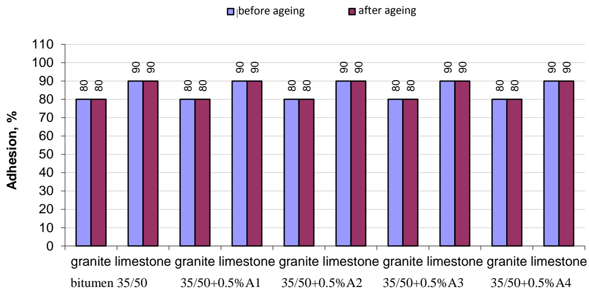
Fig.3. Adhesion of bitumen 30/50 to granite and limestone with the addition of adhesive agents determined by BOP IIA method