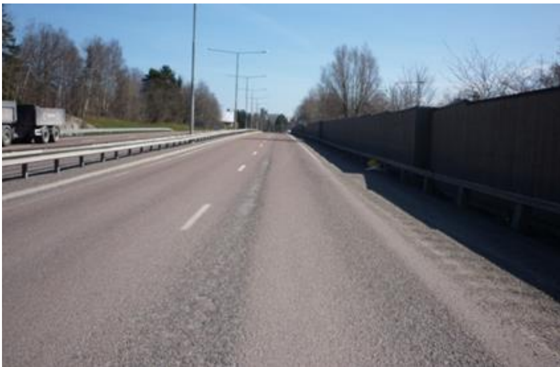
Figure 2: Severe raveling of double-layer PA after only one year of traffic.

In order to improve the durability of porous asphalt laid in two layers, a research project started in 2010, in which participants from suppliers, contractors, a research institute (VTI) and a traffic authority took part. Some earlier and/or other documents reporting about this are listed in references [8][4] Error! Reference source not found. Error! Reference source not found. Error! Reference source not found.