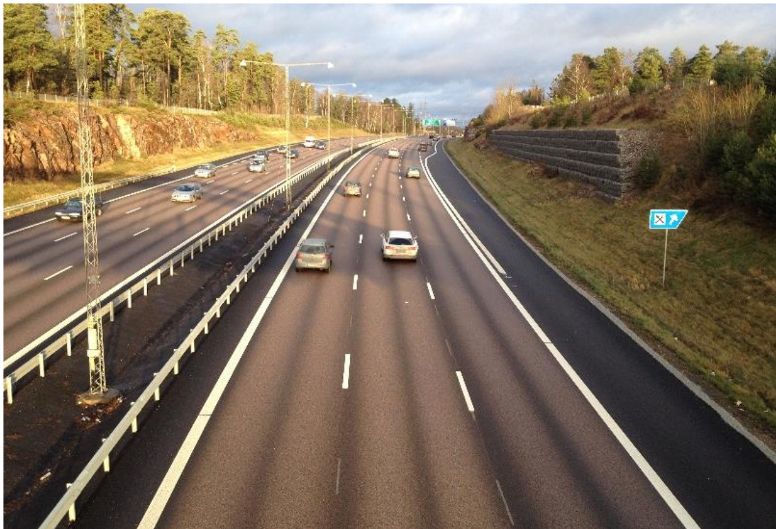
Figure 8: The test road E4 in Rotebro, Stockholm, after a few months of traffic.

The need for traffic noise reduction measures is great in Stockholm, including the approach roads, and one option of considerable interest is to use noise-reducing pavements. Based on the excellent results on E4 in Huskvarna, a test section on the E4 motorway in Rotebro (between Stockholm and Arlanda airport) was repaved with double-layer PA in the summer of 2014. This road has three lanes in each direction. See Figure 8.