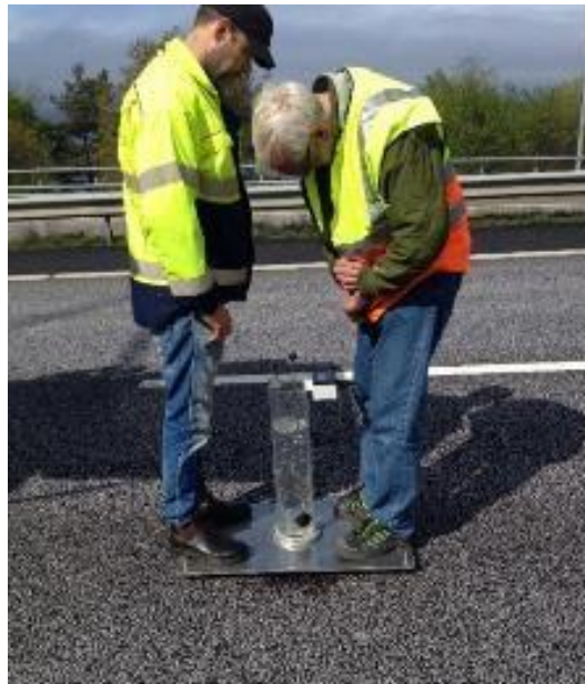
Figure 3: Measurement of the draining effect of a porous pavement according to EN 12697-40

The drainage ability of the pavements have been tested according to EN 12697-40 (Figure 3). The method is a field test of the drainage ability of asphalt pavements that are designed to have permeable properties. The outflow time for water is an indication of the pore capacity to drain water away from the pavement. The method can be used to check if the surface meets the demands on drainage and any deterioration of drainage capacity with time, for example clogging by road debris. No requirements on permeability are related to this method for PA.