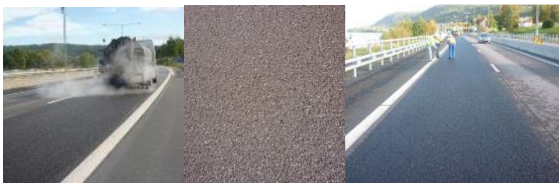
Figure 5: Sealing with Fog Seal of the PA on E4 in Huskvarna, September 2010.

A distance of about 200 m in K1, southbound direction, was sealed in the fall of 2010. Another seal was conducted in autumn 2011 on half of the section that was sealed in 2010. As reported previously, stone losses have been small on these sections. In the autumn of 2013, the entire K1 in both directions was sealed (Figure 5).