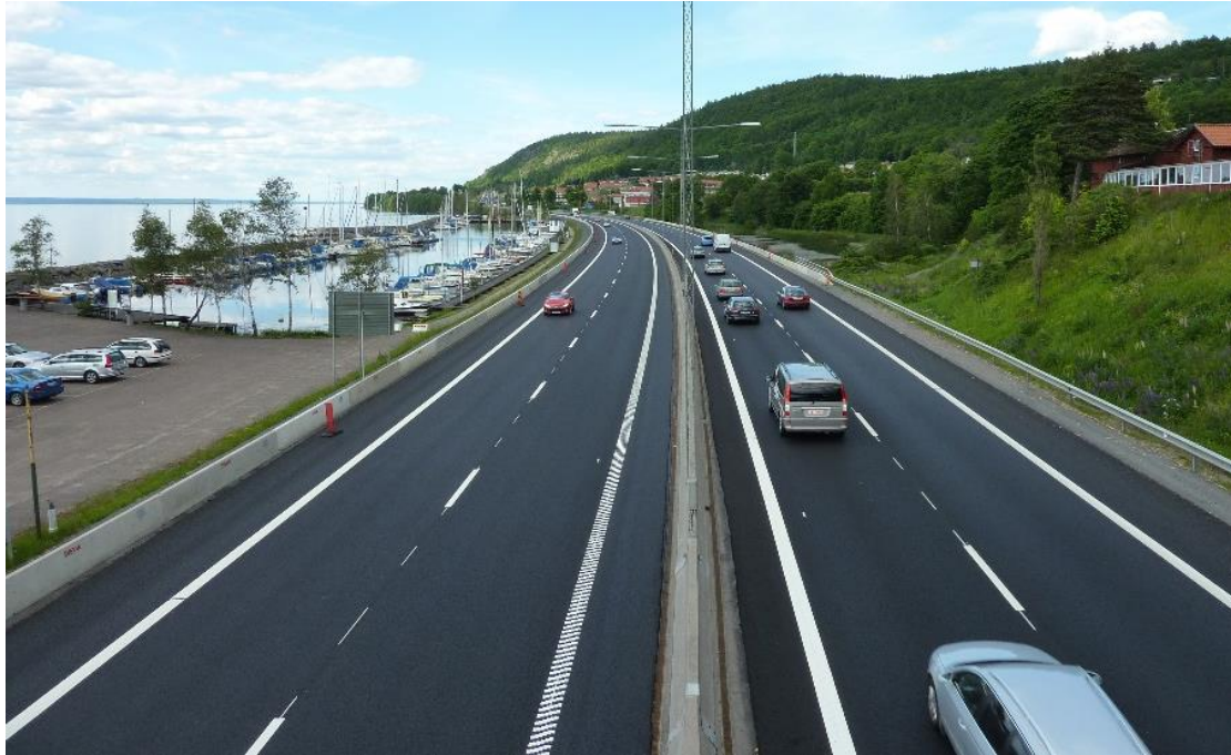
Figure 4: Test road on E4 in Huskvarna just after the pavement was laid in 2010.