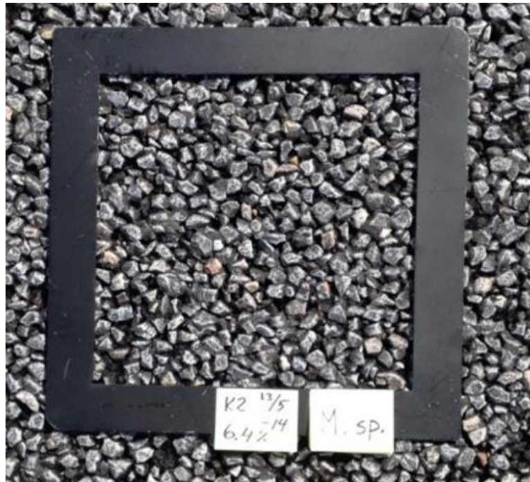
Figure 7: Stone content is high and the open pores are visible between the particles. The number of particles (8/11) within the frame is approximately 360 and three are lost. The pavement (K2 south with rhyolite) was four years old when this photo was shot.